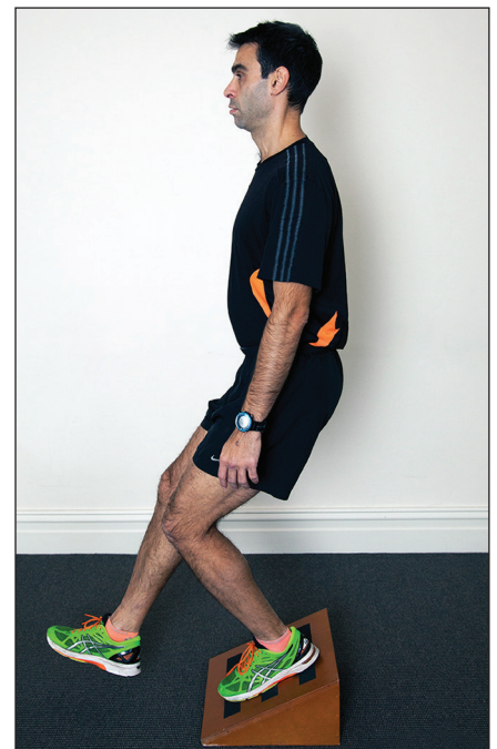
FIGURE 1. Single-leg decline squat performed with an upright torso, to 90° of knee flexion or maximum angle allowed by pain.

The age of the patient must also be considered in the differential diagnosis process. Both patellar tendinopathy and isolated fat-pad irritation are common in adolescents. 13 Adding to the challenge of diagnosis in this age group, excessive